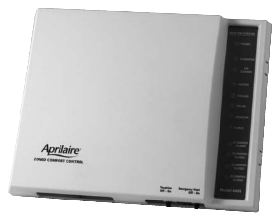
MODEL 6404 SINGLE OR MULTI-STAGE HEAT/COOL OR HEAT PUMP 4-ZONE CONTROL PANEL EXPANDABLE TO 12 ZONES

The Model 6404 Zoned Comfort Control panel offers you the quality and support you've come to expect from Aprilaire. You can count on 24-hour shipping, great technical and sales support and the most reliable dampers on the market.